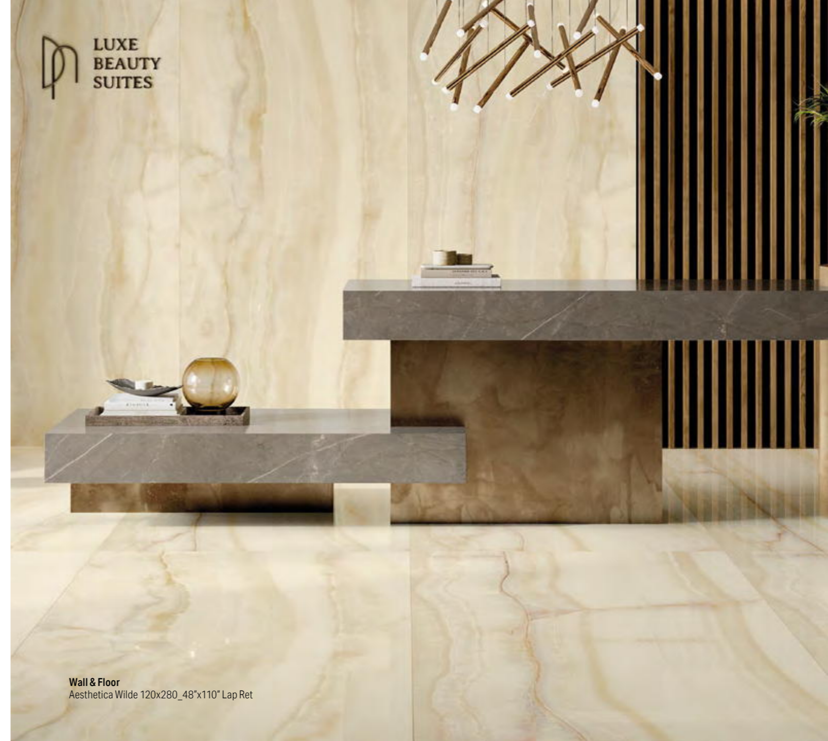
Wall & Floor Aesthetica Wilde 120x280_48"x110" Lap Ret