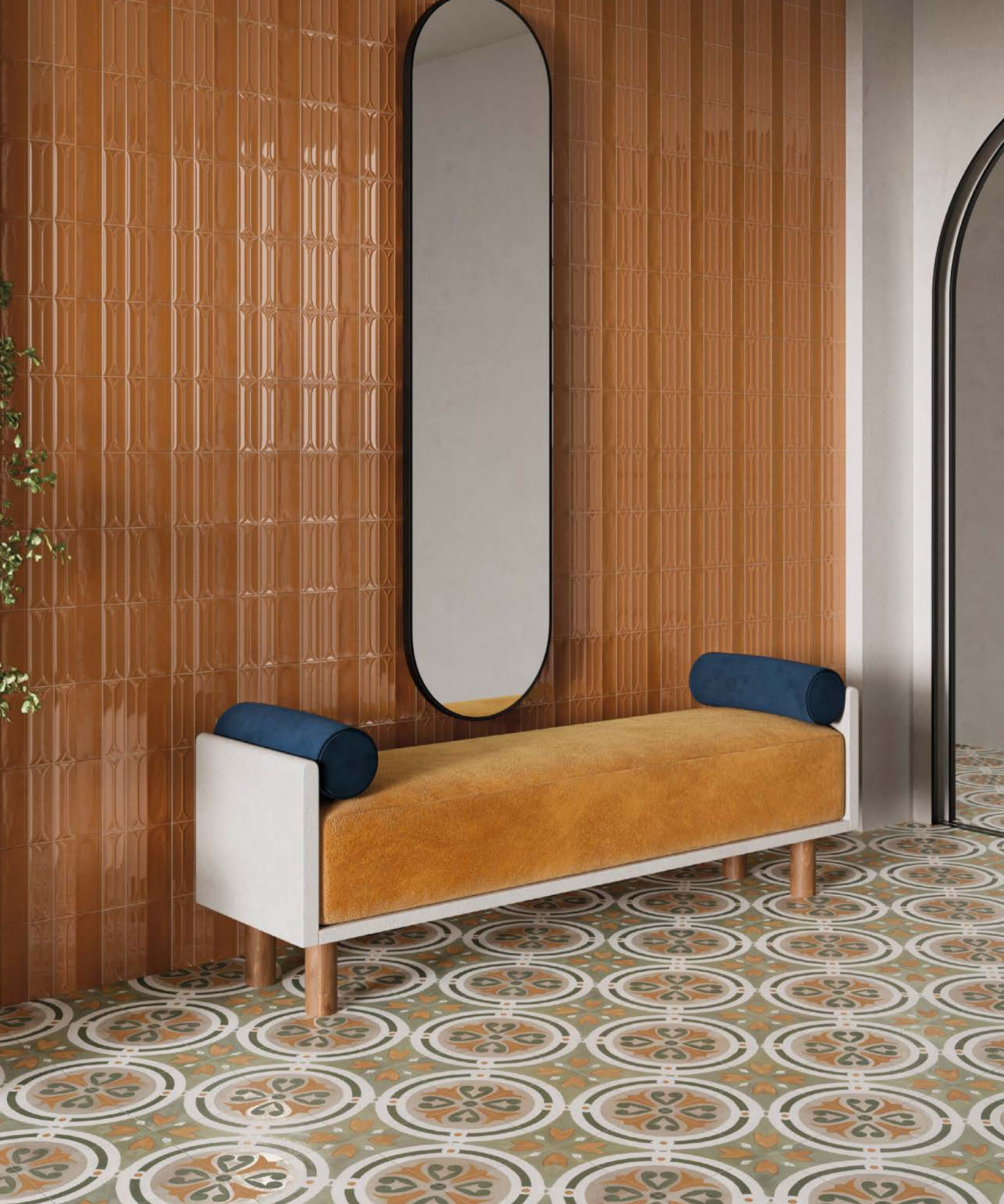
● ELIPSE CLAY/5X15 · GLINT CLAY MATT/5X15 ● AMBER GREEN SP/22,3