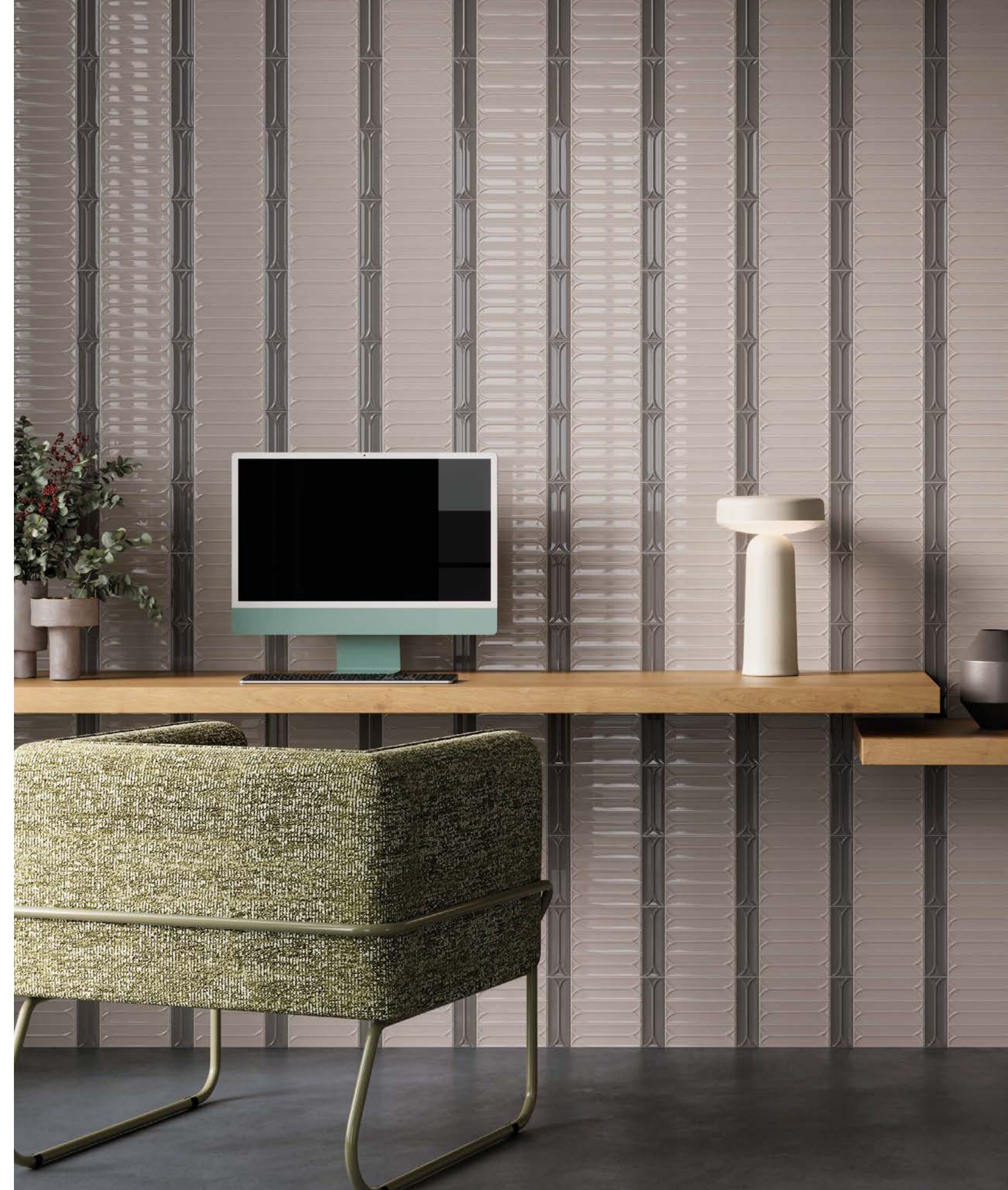
● ELIPSE TAUPE/5X15 · ELIPSE GREY/5X15 ● MERAKI ANTH NT/90X90X0,9/R