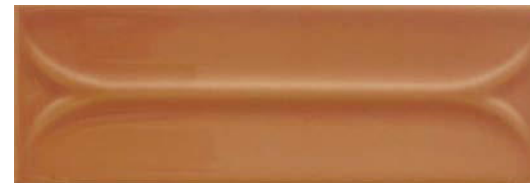
41685 ELIPSE CLAY/5X15 Q67 (4,8x14,6 cm — 17/8x53/4") *141 Mapei