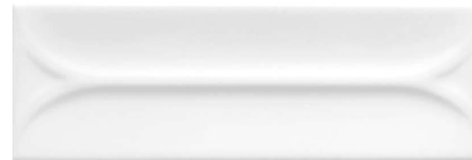
41681 ELIPSE WHITE/5X15 Q67 (4,8x14,6 cm — 17/8x53/4") *103 Mapei