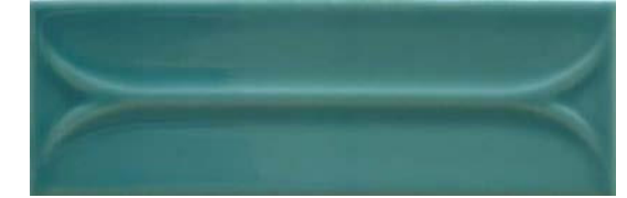
41686 ELIPSE AQUA/5X15 Q67 (4,8x14,6 cm — 17/8x53/4") **08 Kerakoll