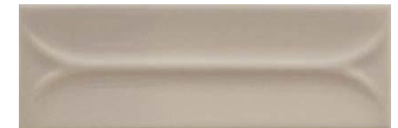
41682 ELIPSE TAUPE/5X15 Q67 (4,8x14,6 cm — 17/8x53/4") *133 Mapei