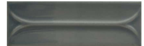
41683 ELIPSE GREY/5X15 Q67 (4,8x14,6 cm — 17/8x53/4") **09 Kerakoll