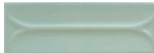
41684 ELIPSE MINT/5X15 Q67 (4,8x14,6 cm — 17/8x53/4") *111 Mapei